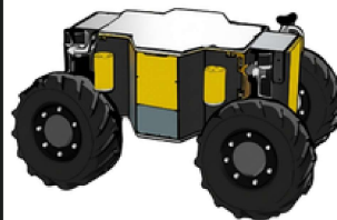
ALL TERRAIN APPLICATION