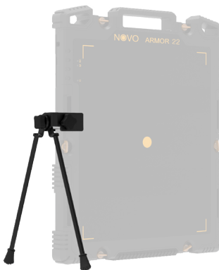
NOVO Armor Stand