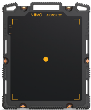
NOVO Armor 22