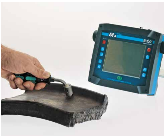
Test set for rough environmental conditions with LED-crack indicator on the probe