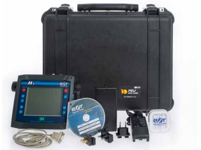
ELOTEST M3 Set