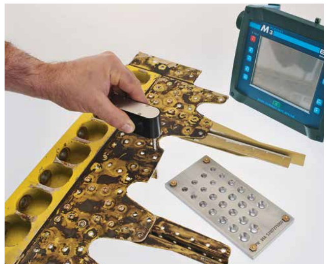
Bore hole inspection with mini rotor on aluminium structures