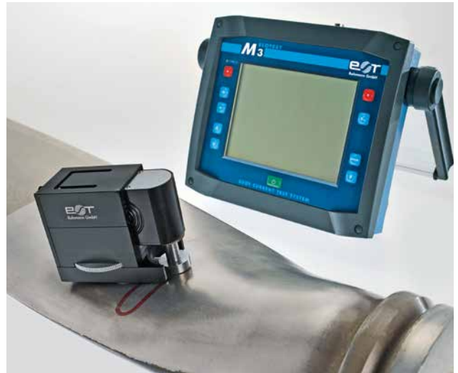
Dynamic surface crack detection rotor blade