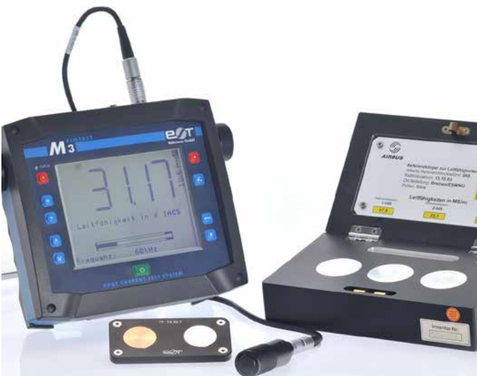
Conductivity measurement in IACS or MS/m from 1 % up to 110% IACS