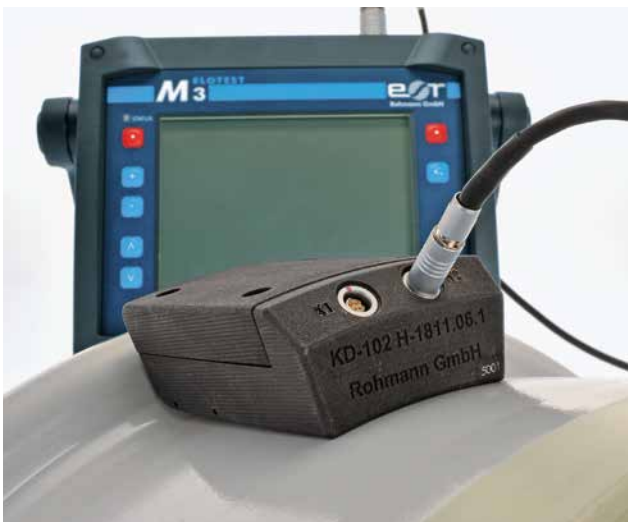
Manual surface crack detection with adapted contour sensor