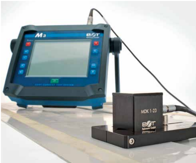
Crack detection of hidden defects in aluminium rivet layers