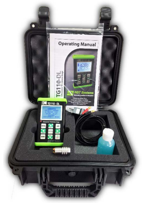
TG-110 Package including a probe