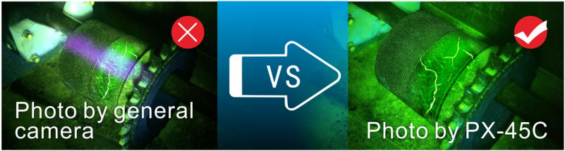
Photo by general camera

Customized Sony Camera Lens with 12.8 Mega-Pixel CCD. Built-in UV filter to avoid glare of photos.