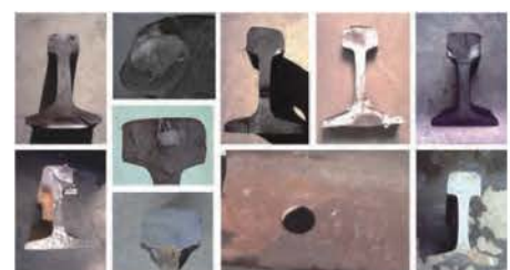
Sample Defects Detected by RailRover