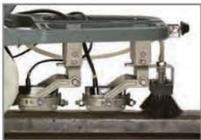
Magnetic Foot Option

RailRover has 9 individual ultrasonic transmit/receive channels for rail testing and an independent hand held channel for defect confirmation, sizing and manual inspection of the weld or rail foot.